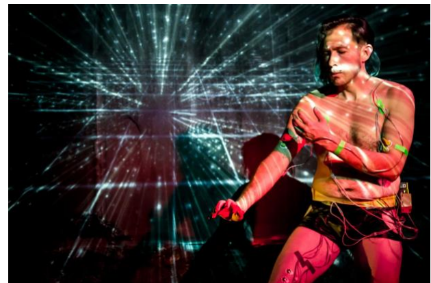
Figure 4. [blinded for review] performance, 2022 where the Joakinator was controlling audio and video.

Since 2019 Joakinator has been used in five different projects encompassing thirteen performances. Among them we have presented Lattice (2022) at Medialab-Matadero (Madrid, Spain), Posibles Presentes (2022) at Umbral de la Primavera (Madrid, Spain), Cyborg Interface: This is Not Your Body (2021) at Cuerpo Romo Festival (Madrid, Spain), A Latent Game (2019) at Tabakalera-Donosti and Birth of a Cyborg (2019) at Noche de Scratxe13 (Vitoria-Gasteiz, Spain). In those projects we have explored different applications for the use of Joakinator, such as creating and embodiment of the media material (sound/video) in the performers body, sonifying the movements of the performer with an interactive music system and exploring new dramatic narratives by the use of the body muscle to control recorded voice sounds.