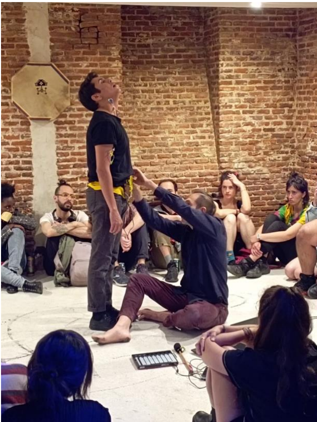
Figure 6. [blinded for review] performance, 2022, Madrid.

SD In the project Posibles Presentes the performer's body controls an interactive system based on voice recorded samples, that speaks of certain theoretical and subjective notions. The configuration for this performance made it possible to explore randomly the different samples triggered by the FSR sensors and control the distortions of the sound through the tone muscle activity and the balance of body weight. This architecture has produced the feeling that the sound material is part of the body, because when you strengthen a muscle, it produces a direct influence on the sampler you are listening to. This shows the potential of Joakinator for transforming body-muscles into an instrument.