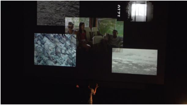
Figure 5. A [blinded for review], 2019.

SD In the project Posibles Presentes the performer's body controls an interactive system based on voice recorded samples, that speaks of certain theoretical and subjective notions. The configuration for this performance made it possible to explore randomly the different samples triggered by the FSR sensors and control the distortions of the sound through the tone muscle activity and the balance of body weight. This architecture has produced the feeling that the sound material is part of the body, because when you strengthen a muscle, it produces a direct influence on the sampler you are listening to. This shows the potential of Joakinator for transforming body-muscles into an instrument.