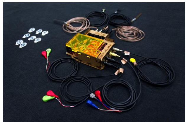
Figure 1. The Joakinator is composed of an Arduino MKR1010 microcontroller, three myoware-v2 electromyography (EMG) sensors and four flexiforce (FSR) sensors.